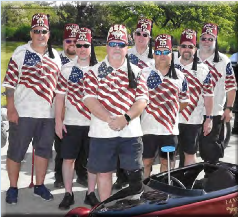
Sterling Heights Memorial Day Parade May 29th